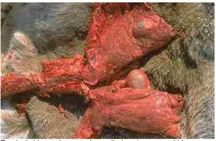
Two hydatid cysts in moose lungs displayed on moose hide.

On Page 3 of the January 2005 Outdoorsman, I described how Hydatid disease in tapeworm eggs spread by wolves causes cysts to form in the internal organs of moose, elk, caribou, deer and humans. I published the following photo of two Hydatid cysts in moose lungs and wrote that in Alaska, more than 300 cases of Hydatid disease in humans had been reported during the 35 years from 1955-1990.